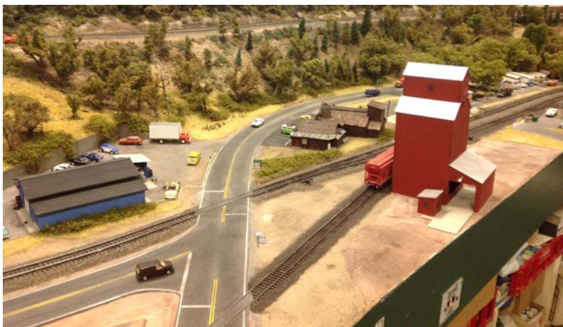
Eagle Junction developing very rapidly

Paul Hendrickson are really leaving their mark. Both structures are based on the real structures with some compression to fit them into the available space. Both were scratch built. The detail on Ed's Oasis is really fine. The main problem is that the front of the establishment, which has a lot of interesting detail, faces the rear of the layout. We'll have to find a way to sneak a mirror into the scene so we can view it. Not that the rest of of the building has a lack of details. The complexity of the roofing is really neat. It consists of simple roofing elements; however, they are combined in a clever way which draws the eye to it, This is topped off with a realistic weathering job. The station is similar to the one in Butte Falls, just like the prototypes. A thank you to Joe DAmato for producing the laser-cut parts. The interesting differences between the two staations are the platform with grass in the cracks and the parking lot, complete with cracks and potholes. You have to get up close to really appreciate the modeling effort. Wonder what is next on their agenda?