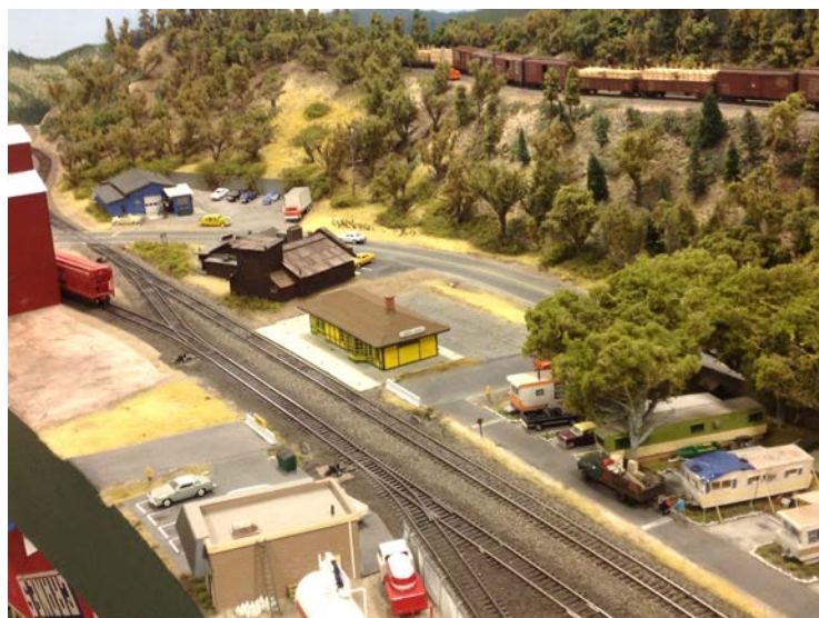
Eagle Point is becoming a real interesting spot to visit