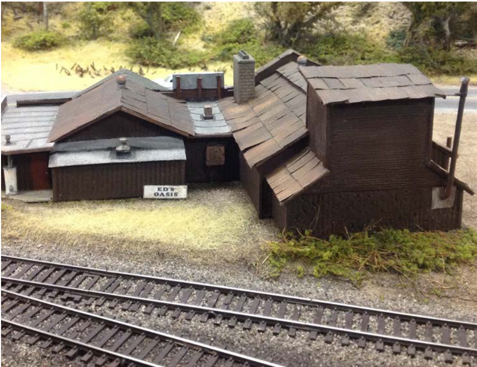
The rear of Ed's Oasis. Note the interesting roof line and weathering