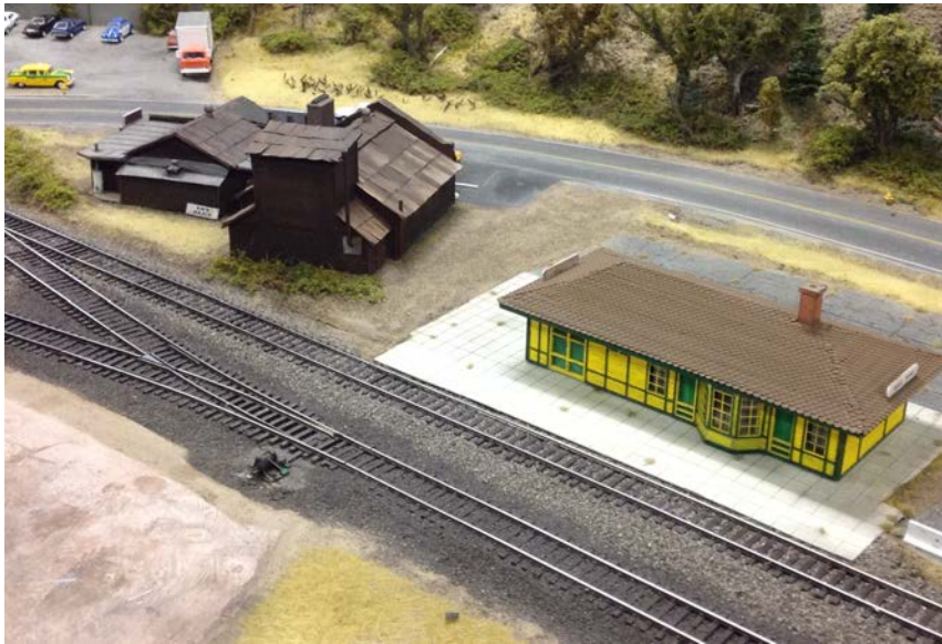
The Train Station and Ed's Oasis are recent additions to Eagle Point