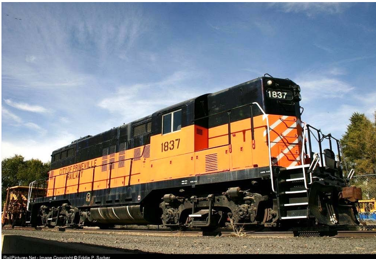
A GP 9 on the City Prineville Railroad

Next month I will talk about modeling some of the industries' there, some sample track plans for switching layouts and how some of the facilities would fit nicely with our modular show layout. That will be followed by another Oregon Short line worthy of note.