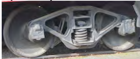
8 [ PRR 2D-F8 ]

Truck 4 has me stumped. It has a nearly circular interface between the side frame and bolster assembly which should make identification easy. A detailed look at the original photo has the wording "Patented Taylor UT485" across the top of the casting. Any candidates??