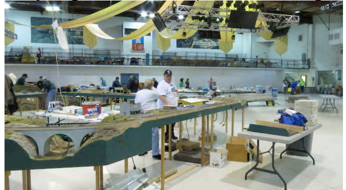
And then it is over and we have to pack it up and put it away in less time than it took to set up

A special thanks to the members who helped set up, run and pack up. It was a very busy and tiring time but well worth it. All proceeds from the show go directly to support the five railroad clubs at the City of Medford Railroad Park— uniquely the only railroad park in the USA operated by five different railroad clubs providing for free Sunday summer outings and train rides.