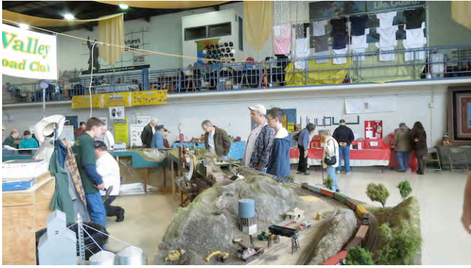
Long trains get attention