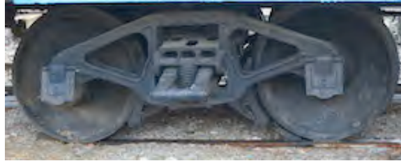
6 [ Barber S-2 ]