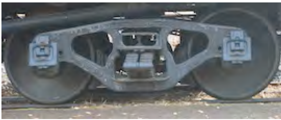
3 [ ASF Double Truss ]