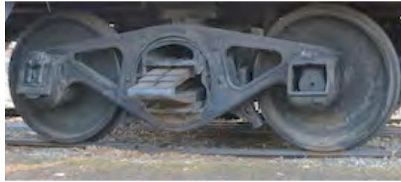
4 [ ?? See below ]