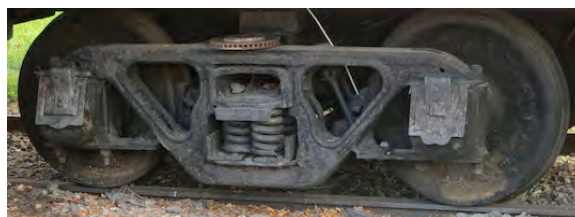
2 [Andrews with coil not leaf springs]