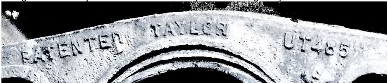
Lettering at top of side frame of Truck 4.

Truck 4 has me stumped. It has a nearly circular interface between the side frame and bolster assembly which should make identification easy. A detailed look at the original photo has the wording "Patented Taylor UT485" across the top of the casting. Any candidates??