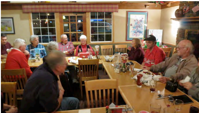
RVMRC Passing Track

The christmas party was held at Elmers Restaurant in Medford. Over 20 people attended. A good time was had by all. The white elephant gift exchange included some 'interesting' times, as usual. I'm sure we have not seen the last of some of them.