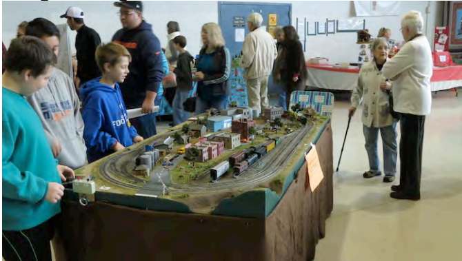
Kids Layout drew quite a crowd