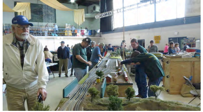
Our younger members keep the trains rolling