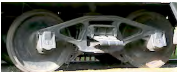
7 [ AAR standard Bettendorf ]