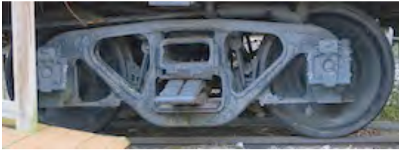
5 [ Andrews ]