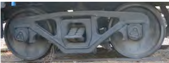
1 [Barber-Bettendorf roller bearing]

Last issue of the Passing Track contained an article on the Caboosees at the Red Caboose Motel in Strasburg, PA. Here is my best guess at the identification of the trucks under the Caboosees. If you have a different identification (I'm no expert in this area), send me an email with a description of the correct id, and we will set the record straight in a future issue. Next issue we will look at the caboose heritage question.