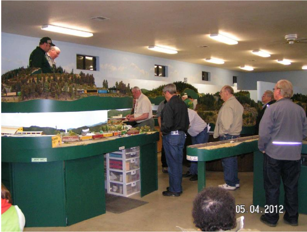
Operators and Onlookers