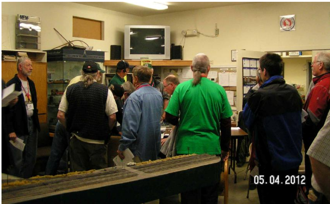
Signups Before Op Session

The Saturday afternoon open house at the Medford Railroad Park for conventioners was well attended. Over 110 conventioners signed the Club guestbook, though many more attended without signing! In appreciation for the Club's efforts, the convention donated $250.00. For a more extensive coverage of the convention activities, visit http://www.pcrnmra.org/conv2012/index.html