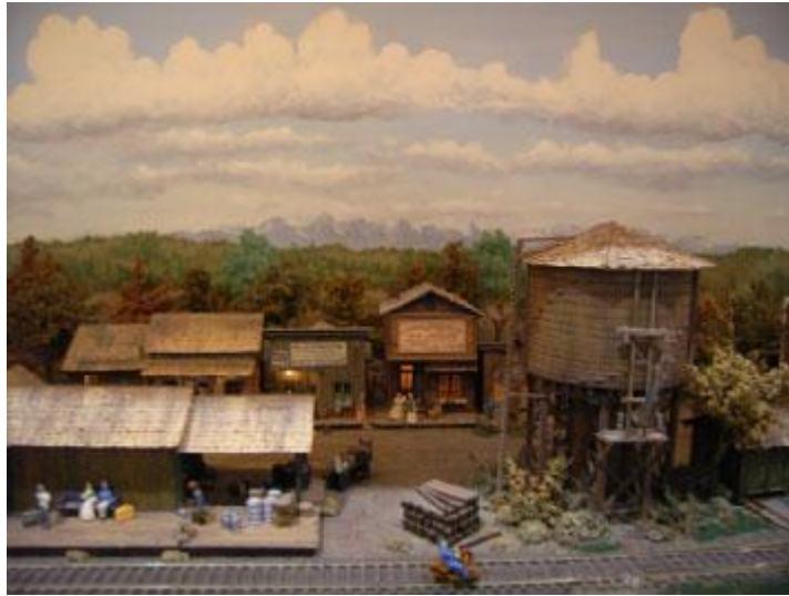
Campbell Scale Models Diorama

Other crowd-pleasers included two award-winning dioramas created by Dick Hotchkiss (Merlin, OR) featuring G-scale trains, and a display of railroad-themed quilts from the Jacksonville Museum Quilters.