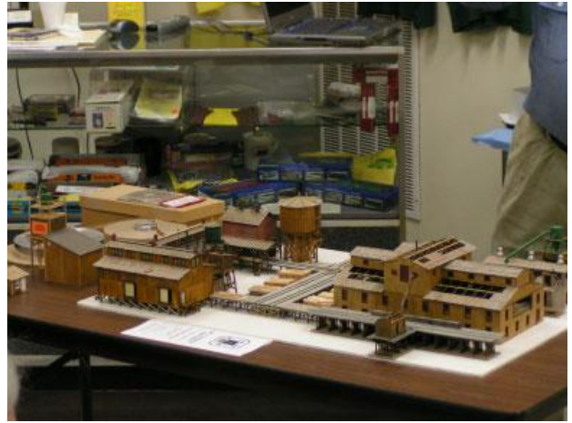
The complete sawmill from Campbell Scale Models weathered with Duncan's diluted mixture of leather stains.